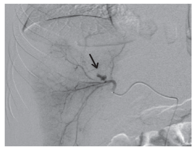
Figure 2: Delayed Arterial Phase Showed Persistent Contrast Leakage with No Wash Out (Arrow)