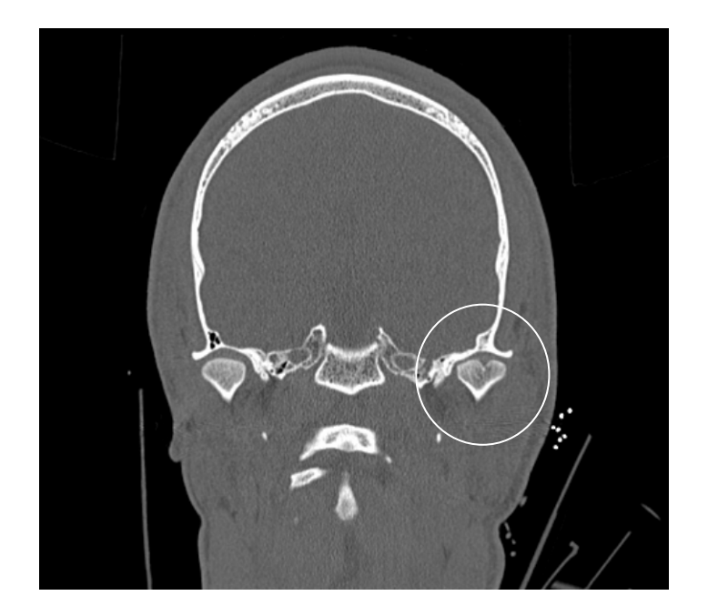
Figure 1b: A Coronal CT Scan Demonstrating the Typical 'Heart-Shaped' Appearance of the Lobulated Condylar Head (White Circle)

A3. Conservative treatment: observation with yearly review appointments is recommended. Patients with bifid condyles are actively treated only if they are symptomatic, and the type of treatment depends on the severity of these symptoms.