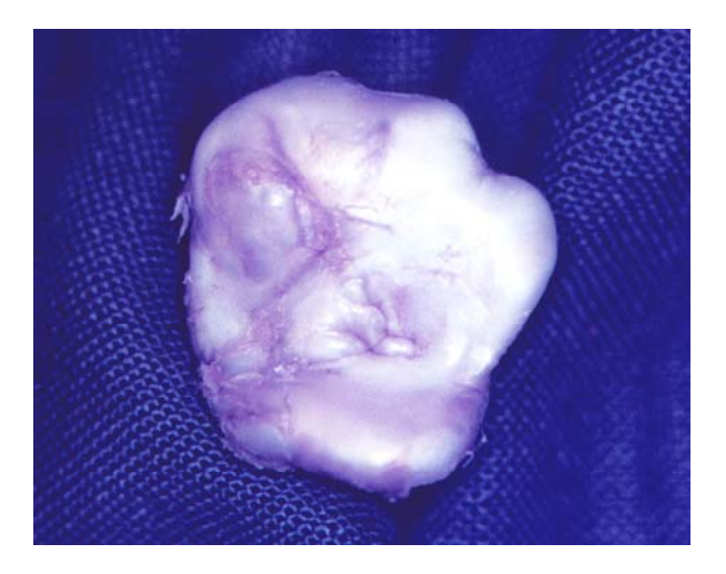
Figure 2: A Condylar Head Showing Minor Bifidity Following a Condyloplasty

Therefore, no treatment is necessary if the patient is asymptomatic, but long-term follow-up is mandatory. Patients with associated arthropathy of the affected TMJ should be treated with occlusal splints and/or arthroscopic surgery to avoid future complications. Condylectomy and arthroplasty for functional repair is recommended in symptomatic cases and cases with associated articular ankylosis.