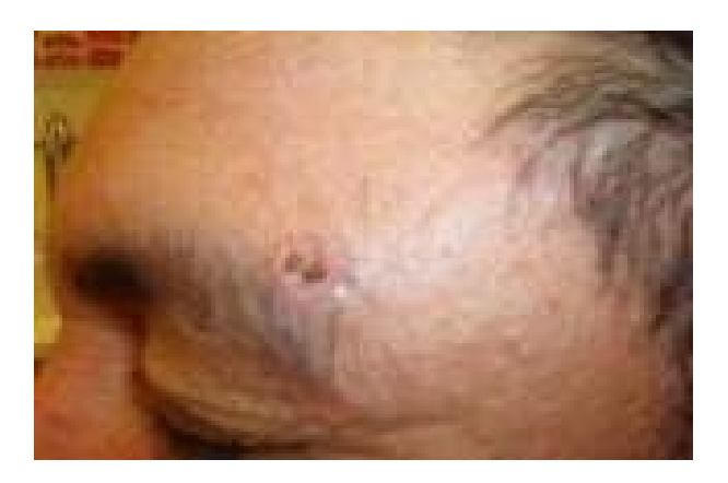
Figure 1: Post Biopsy Photograph of the Keratoacanthoma on the Forehead 61.214 x 79.756mm (300x300 DPI)

Founding Dean, Consultant and Associate Professor in Dermatology Faculty of Medicine **Assistant Consultant of Dermatology Internal Medicine Department King Fahad Medical City Riyadh, Saudi Arabia