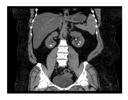
Figure 4: CT Abdomen Showing Bilateral Multiple Renal Stones

CT abdomen showed bilateral multiple renal calculi, see figure 4. No cysts were detected. Creatinine was slightly elevated, other blood investigations were normal. Genetic study could not be performed because of the unavailability of the test.