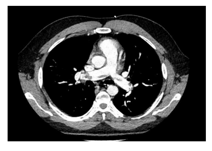
Figure 2: Saddle Pulmonary Embolism

An urgent CTPA revealed progression of the previously noted PE with saddle thrombus formation (Figure 2).