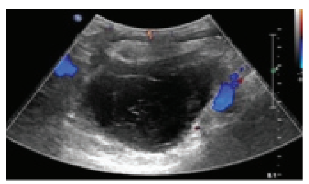
Figure 1: A Longitudinal Ultrasound Image of the Lower Abdomen and Pelvis Showed Well Defined, Multiloculated Fluid Collection with Multiple Septations with No Definite Vascularity by Color Flow Doppler

A contrast-enhanced CT scan of the abdomen and pelvis revealed a large fluid-containing cystic structure in the lower abdomen measuring about 7.5x7.1x5.5 cm, most likely representing abdominal cerebrospinal fluid pseudocyst. A little amount of free fluid was found in the lower abdomen and pelvis with diffuse peritoneal fat stranding and thickening of the peritoneal reflections, see figure 2.