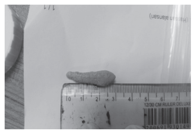
Figure 2: Giant Submandibular Stone