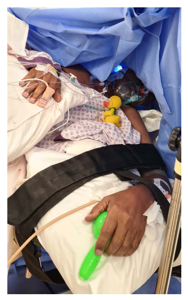
Figure 2: Patient holding toy intraoperatively

In the operating theatre, the patient underwent ultrasound guided insertion of a central line in the right jugular vein, insertion of a right radial arterial line, a urinary catheter, two venous lines, and an oxygen mask adjusted at 4-6 liters of Oxygen (O_2) per minute. He was put on Remifentanil and Propofol infusion at variable rates for conscious sedation.