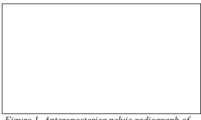
Figure 1. Anteroposterior pelvic radiograph of the reported patient showing persistent right acetabular dysplasia.

Periacetabular triple innominate osteotomy through subinguinal adductor approach was performed<sup>13</sup>. During surgery, the dissection to expose the ischial ramus was carried out lateral to the pectineus muscle trying to perform the osteotomy as close as possible to the acetabulum to achieve better correction. The osteotomy was carried out by mistake in the femoral neck instead of the ischial ramus. It involved about one third of the femoral neck thickness before the complication was discovered. The femoral neck fracture was fixed with two cannulated cancellous screws (Fig.2). The ischial ramus was exposed medial to the pectineus muscle and the triple osteotomy was completed as usual.