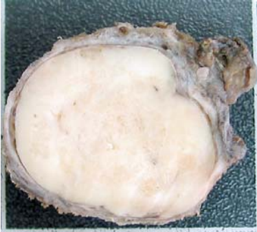
Figure 1: The Excised Thyroglossal Cyst is Lined by Thin and Intact Wall. The Lumen is Entirely Filled by a Firmly Adherent Soft, Solid, Homogenous Creamy Content

the hyoid bone which histologically showed papillary thyroid carcinoma (Figure1). He was followed every 6 months and for 6 years with no sign of local recurrence and his thyroid function remained at euthyroid levels.