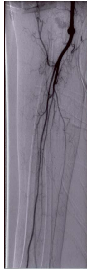
Fig 2. Angiogram of the same patient after AV-Fistula compression

The patient underwent exploration of the access (Fig 3). Distal vessels patency were confirmed by Fogarty catheter. Four to 7 mm tapered Polytetrafluoroethylene (ePTFE) graft originating from the brachial artery proximal to the access site anastomosed into the same artery distal to the access. The brachial artery between the source of fistula inflow and the distal anastomosis of the graft was divided and ligated (Fig 4). Access patency was assessed by the presence of thrill and bruit over the fistula and confirmed by doppler flow measurement. Post-operatively, radial pulse became palpable; the hand became warm and nearly normal capillary refill. Dialysis started two days after the procedure without pain or complaint. Doppler US, three weeks post-operative showed good flow in the radial artery (Fig 5).