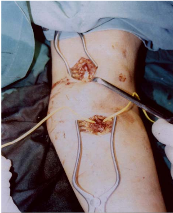
Fig 3. Surgical exploration of the AV-fistula and brachial A Proximal to fistula origin.