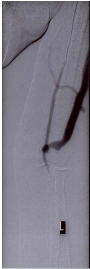
Fig 1. Left arm angiogram of steal syndrome showing diversion of blood to the AV fistula with attenuated distal vessels.

pain disappears within few minutes after cessation. On examination, the patient hand was pale and cool with delayed capillary refill. A thrill of the fistula was present in the graft, but the radial pulse was feeble. No significant paresthesia or weakness. Left upper limb angiography showed normal brachial artery, filling of the cephalic, subclavian and innominate veins and attenuated radial and ulnar arteries (Fig 1). Angiogram after A-V fistula compression showed well-delineated radial and ulnar arteries and good blood supply to the hand (Fig 2).