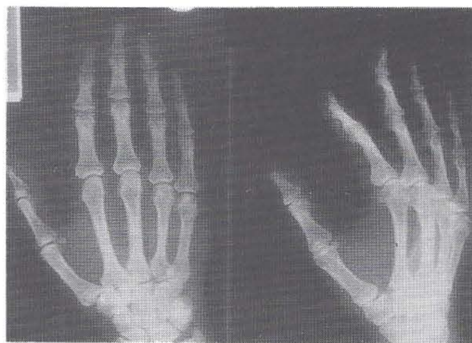
Fig 1. Anteroposterior and oblique radiographs of left hand showing a very prominent radial condylar margin of the metacarpal head of index finger.

Exploration of the MCP joint was carried out through a palmar incision. The accessory collateral ligament was tethered on the radial side of the metacarpal head. The ligament was released. The radial projection of the metacarpal head (Fig. 2) was resected and this eliminated the problem of locking and achieved full range of motion of the MCP joint. The accessory collateral ligament was reattached. Postoperatively, the patient regained full motion (Fig. 3). After 4 months, the patient presented with locking on the opposite side and underwent the same procedure.