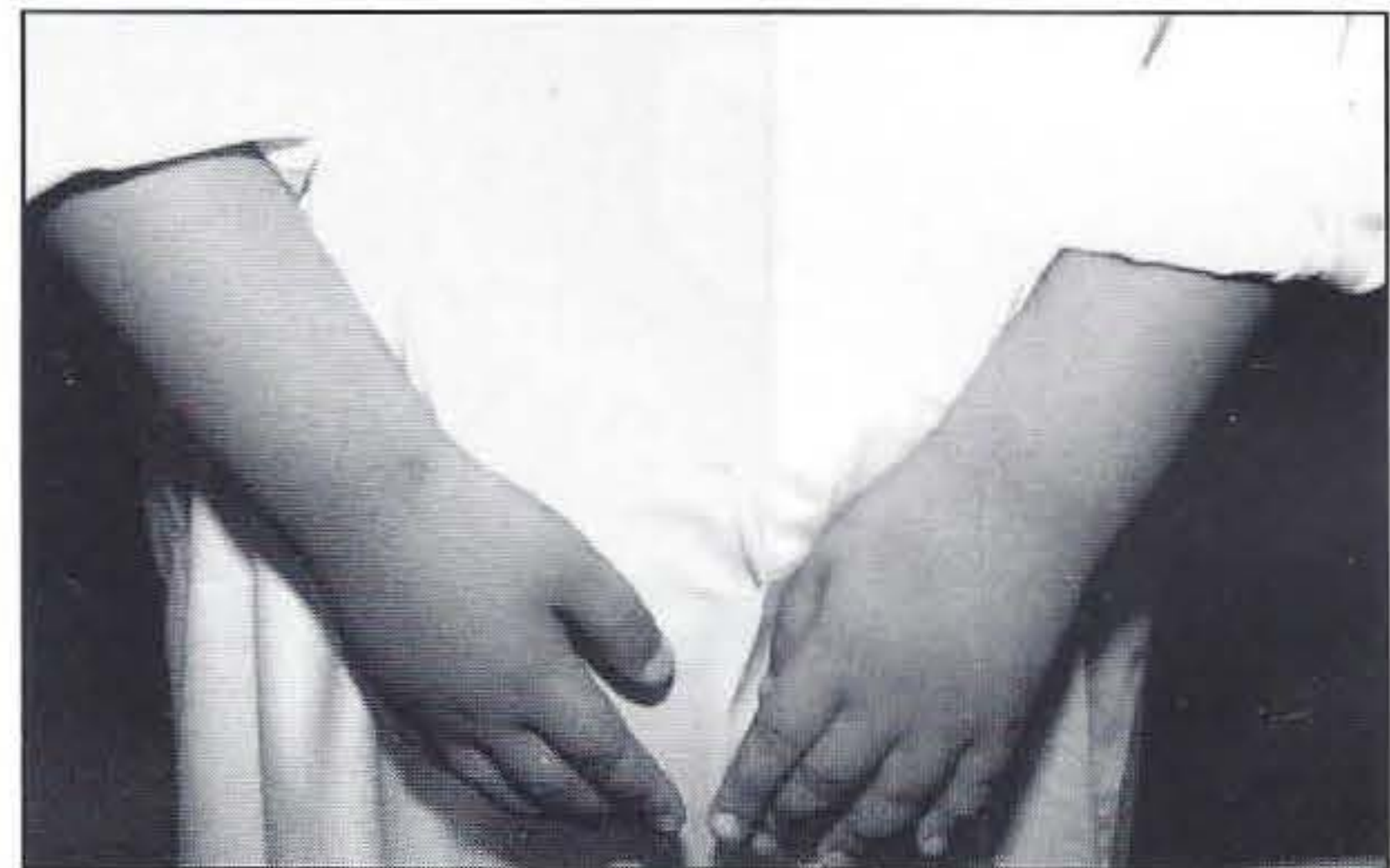
Figure 1: The hands of the patient showing small hands

broad-spectrum antibiotics, intravenous glucose solution and 30% oxygen via head box. Five days later, because of poor sucking reflex, he was fed by nasogastric tube for two weeks. He started to suck the bottle and the breast very slowly. His blood culture was sterile. Blood glucose, urea, electrolyte and calcium were normal. Brain ultrasound was normal. Thyroid function test showed slightly elevated TSH (T3 and T4 were normal), for which he was treated with thyroxine for 3 months until a repeat test was reported normal.