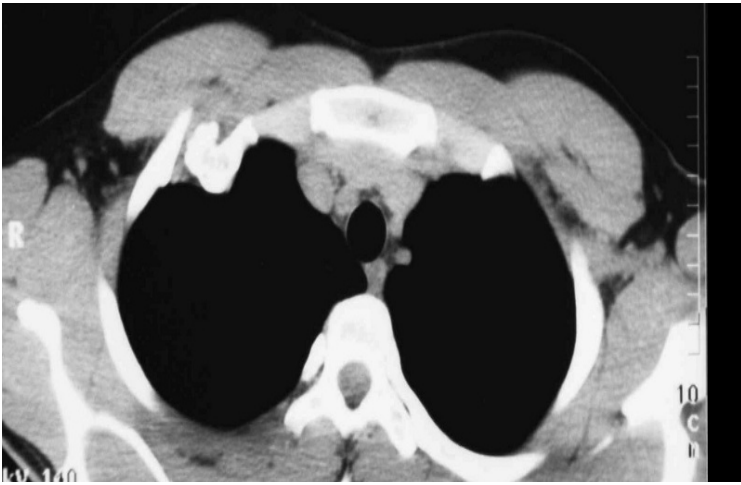
Figure 3 (a)