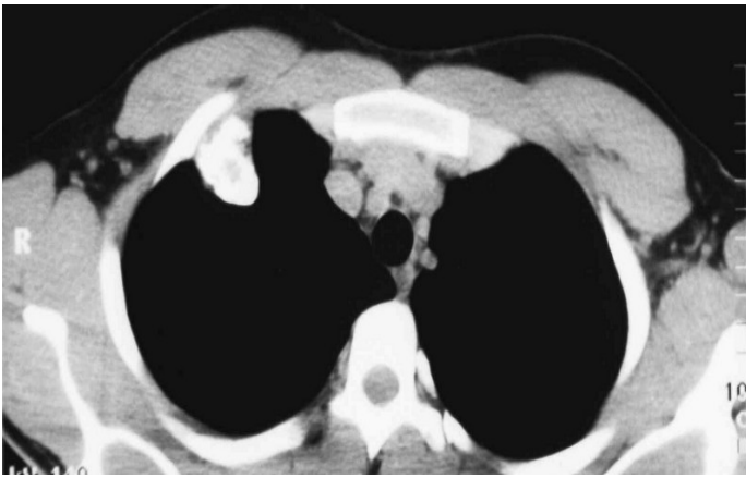
Figure 3 (b)

Figure 3 (a and b): CT Scan of the Chest Demonstrating a Sessile Exostosis 4x3 cm Arising from Right First Rib's Costochondral Junction Extending beneath the Second Rib, Pushing the Pleura and the Lung Inwards