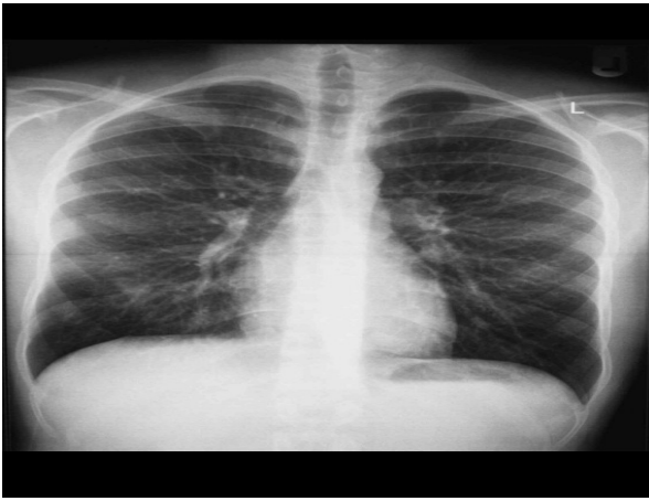
Figure 4: Postoperative Chest X-Ray with No Evidence of the Exostosis and Normal Lung Parenchyma