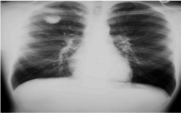
Figure 1: A Posteroanterior (PA) Chest X-Ray Showing a Rounded Patchy Heterogeneous Dense Opacity 3x3 cm in Right Apex