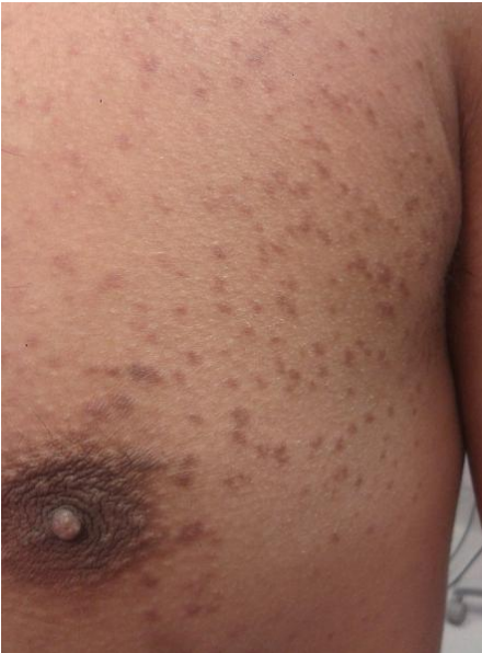
Figure 1: Numerous Skin Colored and Erythematous Papules on the Chest

Examination revealed symmetrical, widely distributed, flesh-colored papules, some were erythematous, others were brown, 2-3 mm in size on the anterior aspect of the trunk and few over the shoulders, see figure 1.