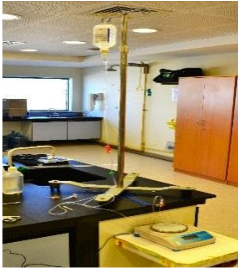
Figure 1: Experimental Set-Up

Kinks were induced in cannulae by folding the catheter tube over itself at the point where the cannula shaft met the hub and held in this position for 10 seconds. Figure 2 shows two cannulae of different gauges having undergone the process of kinking.